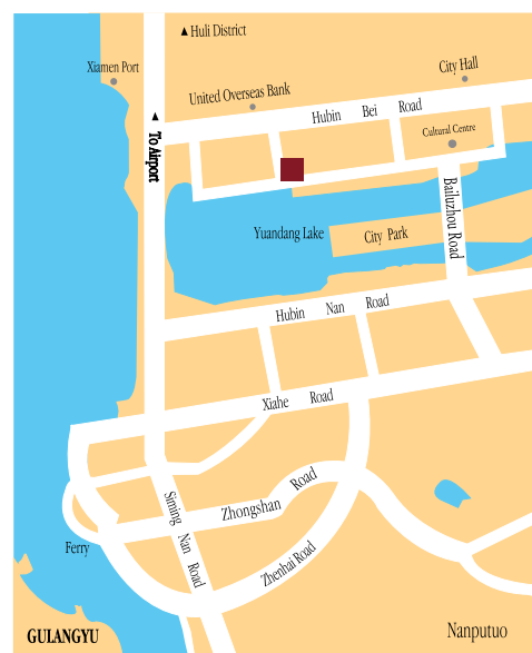
Marco Polo Xiamen